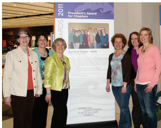
2011 NTI -President's Award for Chapters