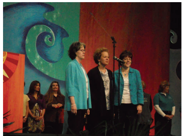
2011 NTI -President's Award for Chapters